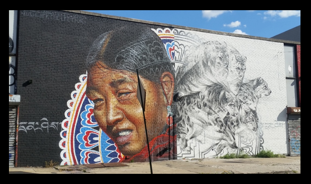
Bushwick collective. Brooklyn, N.Y.

Flipcharting; posters; mapping; quickthinks; drawing; cards; cartoons; sketches; artwork; chalkwork; painting; photographs; charts; calendars; plans; family trees; diagrams; montages; collages