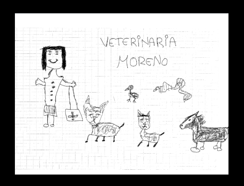
Drawing of a group of young people with intellectual disabilities. UniverDi. Jaén, Spain