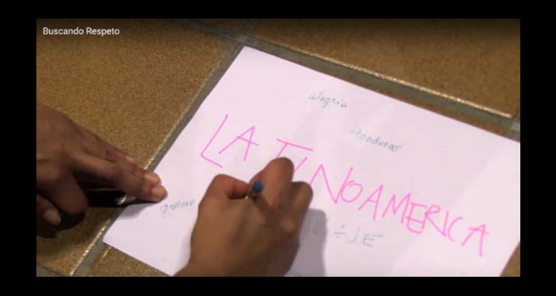
Documentary Buscando Respeto