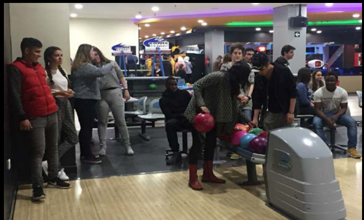
Alphabetization project. Complutense University of Madrid- Ciudad Joven.