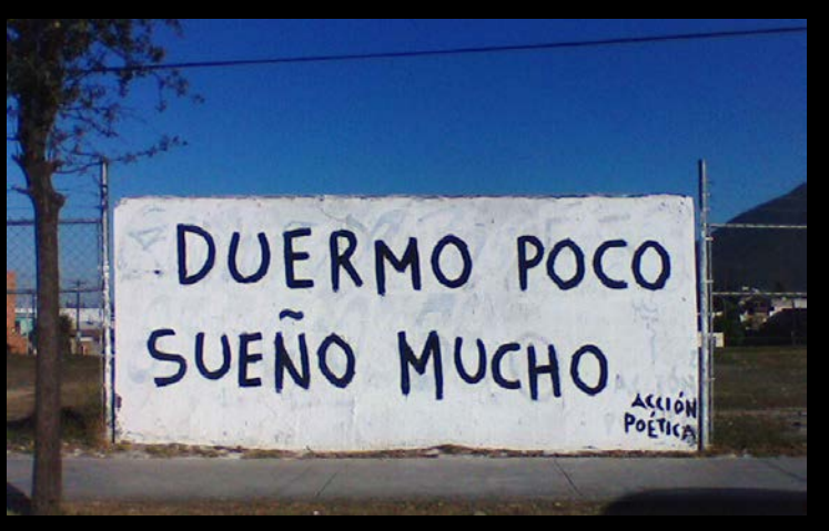
"I sleep little, I dream a lot" Poetic Action. Argentina

stories; novels; poems; letters; diaries; e-mails; homework; logs; quizzes; leaflets; questionnaires; reports; minutes; summaries; newspaper cuttings; statistics; articles; handouts; critical incident analysis; task analysis; recorded observations; group contracts; evaluation sheets; official documents