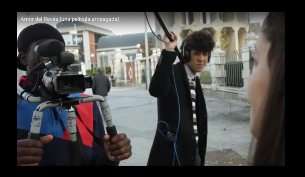
"Upside Down Love, A risky movie" (Amor del Revés. Una película arriesgada)

audio-video; CD; slides; film; videoconferencing; photography; computer; internet; virtual; one-way screens